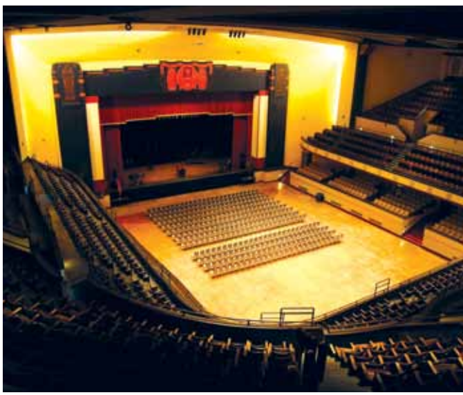
Municipal Auditorium and CenturyLink Center highlighted in national media.