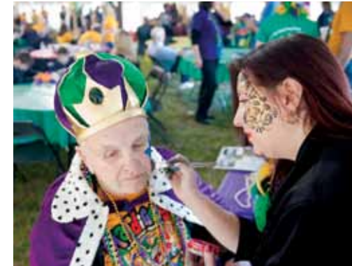
The Tourist Bureau will host 9th annual Mardi Gras Bash in February.

Mardi Gras Bash gives out-of-town groups a "home base" during the parade, making it possible for them to relax and enjoy the festivities. Groups can also add other Carnival experiences to their overnight itineraries such as behind-the-scenes tours on how to make a king cake at Julie Anne's Bakery, tour the Krewe of Gemini Mardi Gras Museum and shop for Mardi Gras decor and accessories at Tubb's Hardware and Rentals.