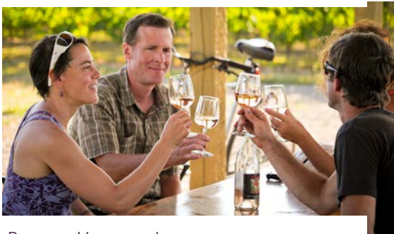
REDGATE VINEYARD INDEPENDENCE, OREGON