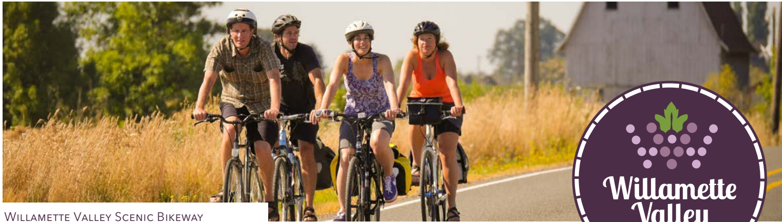
WILLAMETTE VALLEY SCENIC BIKEWAY