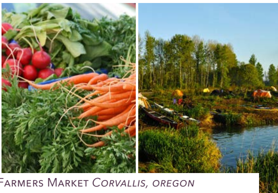
FARMERS MARKET CORVALLIS, OREGON WILLAMETTE RIVER WATER TRAIL