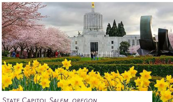
STATE CAPITOL SALEM, OREGON

EUGENE, CASCADES & COAST: Begin your journey in Eugene, located at the south end of the Willamette Valley just two hours south of Portland. Browse through locally-owned bike shops, urban tasting rooms and restaurants. Cycle the extensive bike path system throughout the city, or head to nearby Fern Ridge Reservoir for a fun day of boating, swimming and wildlife watching. Discover the many vineyards that line Territorial Highway, then cozy up for the night at a hotel or bed and breakfast. The next day, begin your ride with serious carbo-loading at Off The Waffle a local favorite with a menu full of fresh, organic fare. You'll find three of the state's official scenic bikeways here, all with breathtaking vistas, history and challenge. The Covered Bridges Scenic Bikeway follows the paved Row River Trail, taking you back in time via six of the region's 20 historic covered bridges. Those looking for an epic ride by lava beds and up a mountain pass should head for the McKenzie Pass Scenic Bikeway, which follows Hwy 242 through pine forests and ancient lava flows, then descends to the soothing pools at Belknap Hot Springs Resort. Or, bike out to Armitage Park, where you can head northward on the lovely 130-mile Willamette Valley Scenic Bikeway. Contact: Meg Trendler - Meg@EugeneCascadesCoast.org