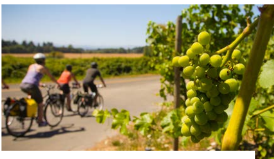
ANKENY VINEYARD SALEM, OREGON

ALBANY: Continue on the Willamette Valley Scenic Bikeway to historic Brownsville, where everything is within walking distance and you can visit spots where the movie "Stand By Me" was filmed. Get a snack at Randy's Coffee, then continue to Albany, where you can visit the upscale Sybaris Bistro, the Albany Farmers Market, the Albany Pix Theater and antique shops, all within a 10-block area. At the Carousel Museum, you'll see volunteers hand-carving the animals for a historic carousel. Tours are free and offer a behind-the-scenes peek into the carving studio to watch artists at work. Ride past historic homes or take a paved riverfront path to Deluxe Brewing to sip smooth German-style lagers and eat delicious barbecue; or Calapooia Brewery, where you can taste their famous chili beer while you cool off on the covered patio. Contact: Sherri Pagliari - sherri@AlbanyVisitors.com