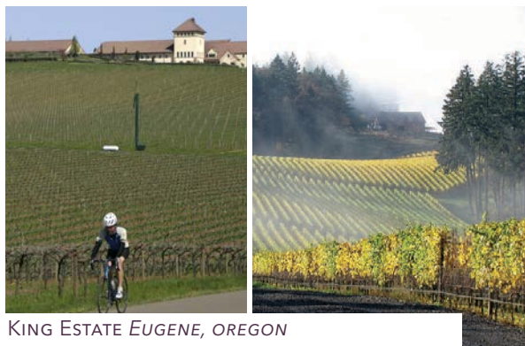
KING ESTATE EUGENE, OREGON WINTER'S HILL VINEYARD DAYTON, OREGON

Drink in the lush countryside of the Willamette Valley on an Oregon Wine Country cycling trip. With miles of beautiful back roads and rugged mountain trails, plus the nation's first official Scenic Bikeway, the Willamette Valley offers an unforgettable cycling adventure.