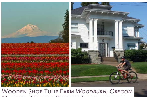
WOODEN SHOE TULIP FARM WOODBURN, OREGON MONTEITH HISTORIC DISTRICT ALBANY, OREGON