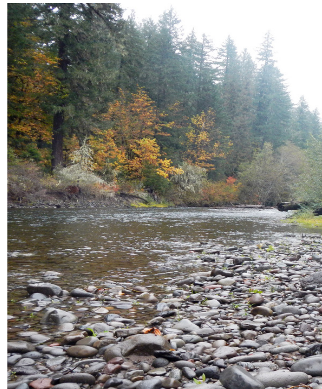
North Fork of the Middle Fork, Willamette River