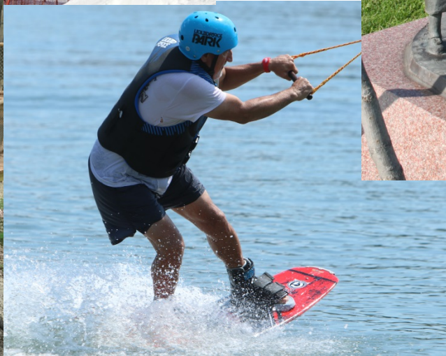
FLVC Marketing Day - September 14, 2016