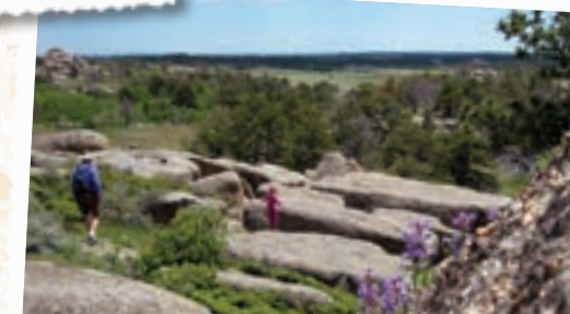
Exploring among the boulders