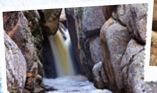
Hidden Falls near Crow Creek Trail

The bike trail system has everything from fast, flowy single-track routes and play areas to rugged rock garden climbs and artificial free-ride features. These scenic trails feature hidden waterfalls and challenging twisty rocky