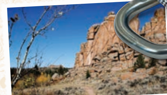
Turtle Rock Trail at Vedauwoo

More information: USDA Forest Service Medicine Bow National Forest (307) 745-2300 • www.recreation.gov