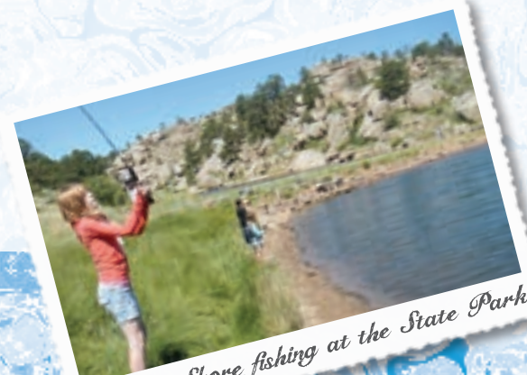
Shore fishing at the State Park