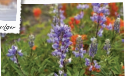
Wild Lupine and Indian Paintbrush