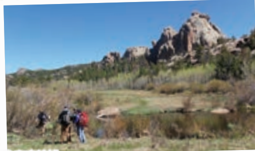
Hiking in to Reynolds Hill