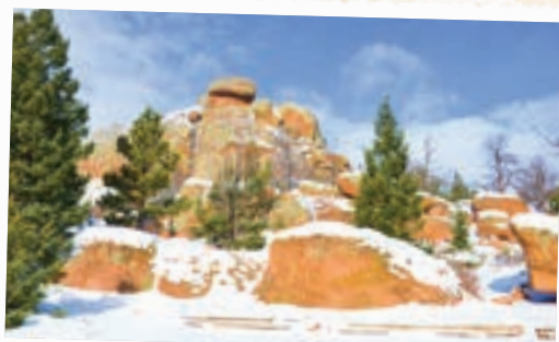
Vedauwoo is truly a winter wonderland!