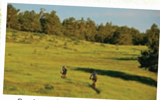
Explore Wyoming's wide open spaces

VISIT CHEYENNE THE CONVENTION & VISITORS BUREAU 121 W 15 TH ST, SUITE 202 • CHEYENNE, WYOMING 82001 1-800-426-5009 • WWW.CHEYENNE.ORG