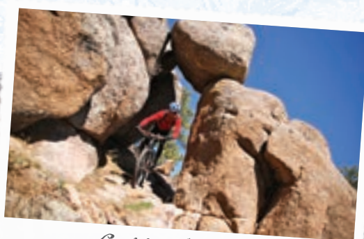
Cruising through "The Door"

trails for intermediate and advanced riders. Beginning bikers will enjoy the miles of basic paths which wind between the reservoirs.