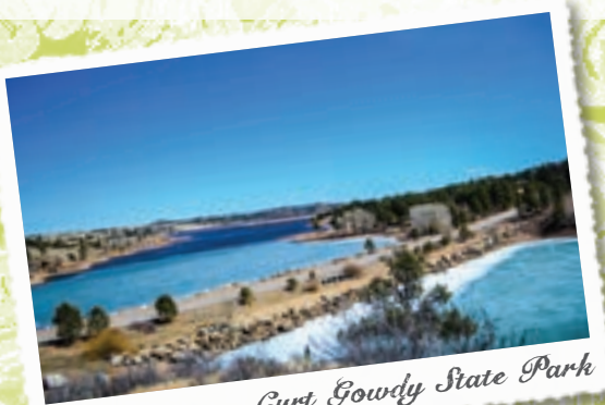
Curt Gowdy State Park