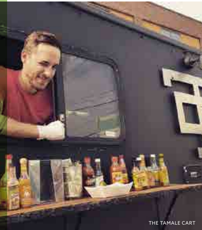
THE TAMALE CART