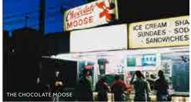
THE CHOCOLATE MOOSE

Gourmet Popcorn made with the finest ingredients. 1503 Atwater Ave.; 812-334-7707; ingaspopcorn.com