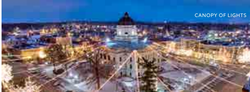
CANOPY OF LIGHTS

100-mile bicycle tour through the beautiful, hilly landscape of the area. October 21-23; throughout the area; hillyhundred.org