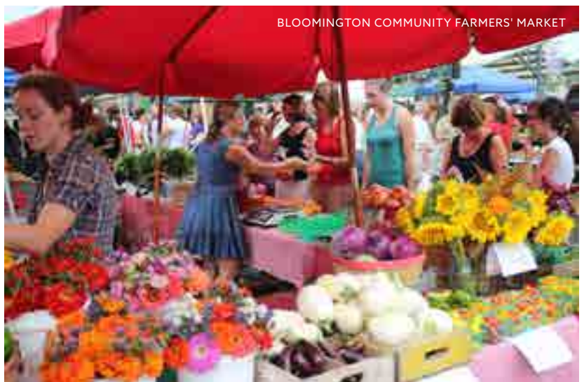
BLOOMINGTON COMMUNITY FARMERS' MARKET

Sample craft brews from around Indiana and the Midwest. April 9; Woolery Mill; brewersofindianaguild.com