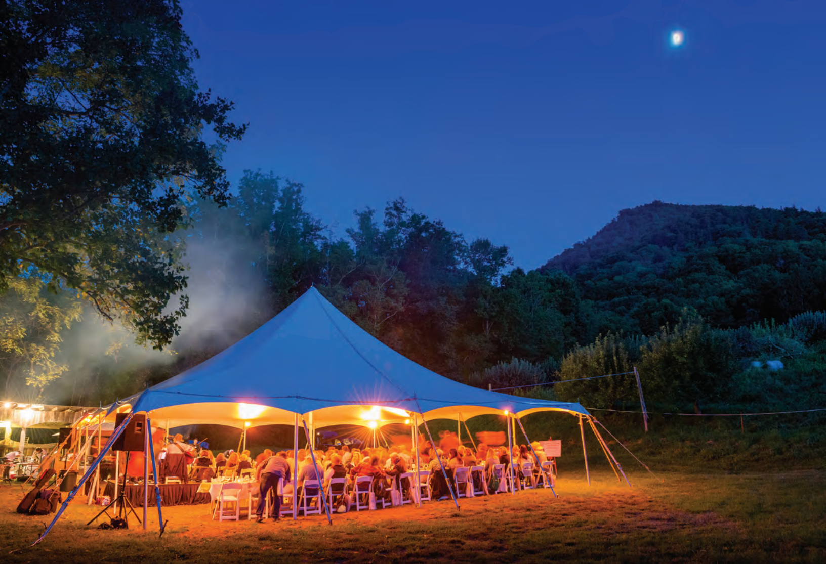
BLIND PIG SUPPER CLUB AT HICKORY NUT GAP FARM