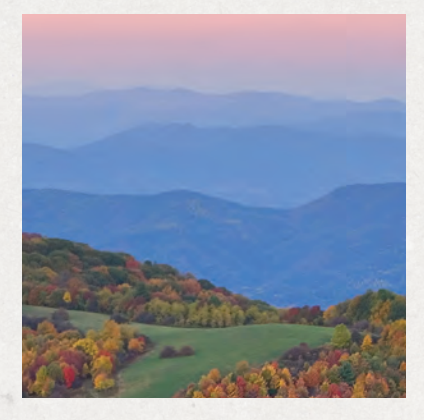
CELEBRATE THE SEASONS AND GATHER TOGETHER AROUND THE TABLE