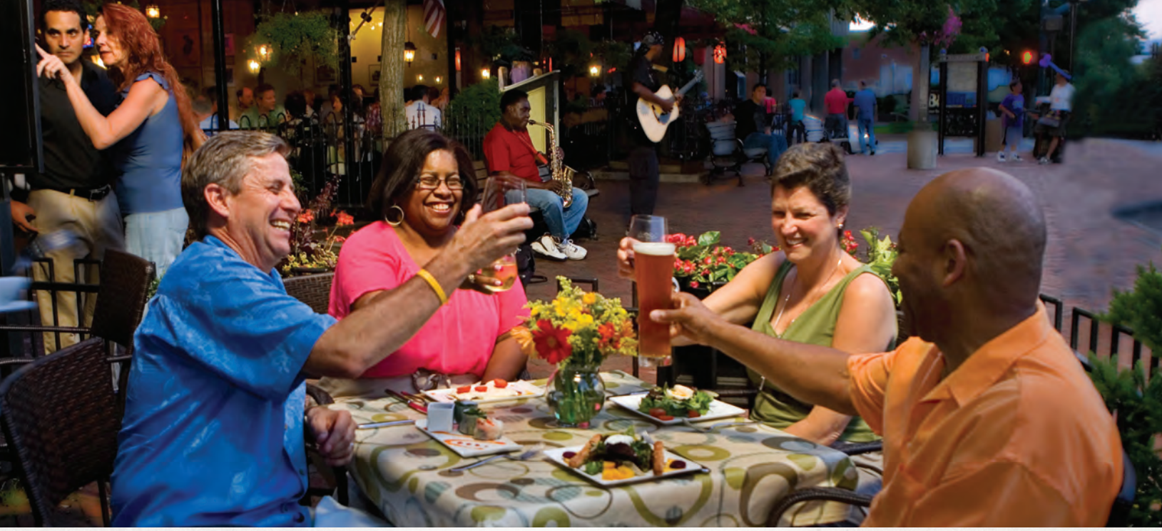
OUTDOOR DINING AT PACK SQUARE