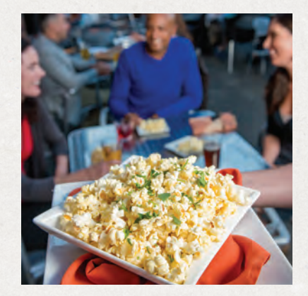
SMALL BITES AND SNACKS FOR ANY OCCASION