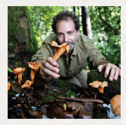
DIG IN! TRAILS, TAILGATE MARKETS, FORAGING, FARM TOURS AND FOOD TRUCKS