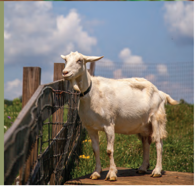
LOOKING GLASS CREAMERY

Hoop cheese is a Southern tradition. Basically a cheddar cheese made only from milk with the whey completely pressed out, hoop cheese contains no cream and salt. It's placed in a round mold called a hoop and is sold in large wheels coated with red wax.