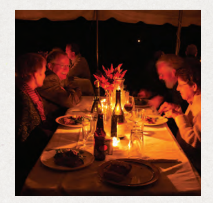
MOUNTAIN GATHERINGS AND CELEBRATIONS