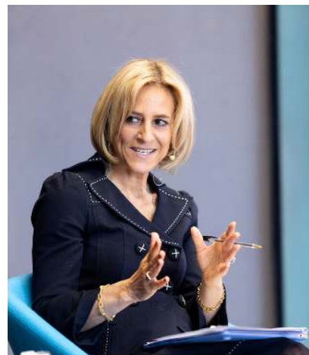
Pictured: Emily Maitlis